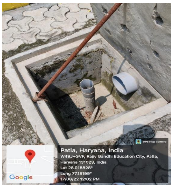
(A) RAIN WATER HARVESTING